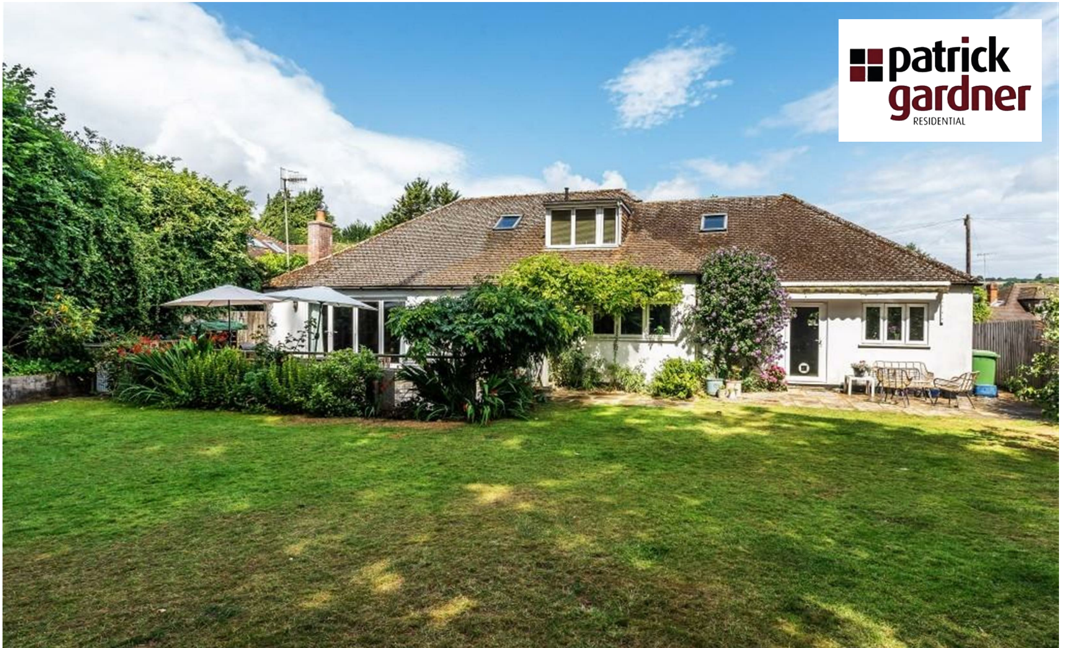
7 The Paddock, Westcott, Dorking, Surrey, RH4 3NT